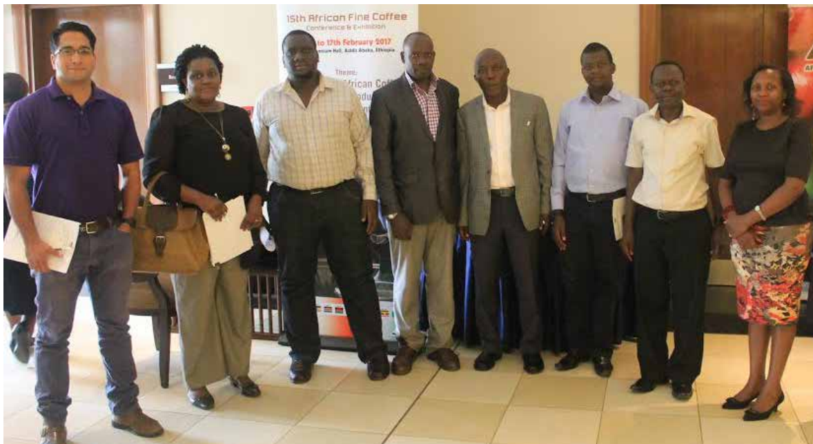
A cross section of members who attended the AFCA General Meeting at Sheraton